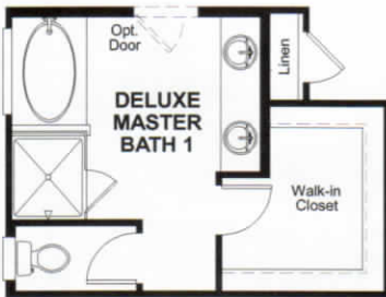
OPT. DELUXE MASTER BATH #1