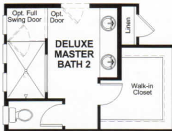
OPT. DELUXE MASTER BATH #2