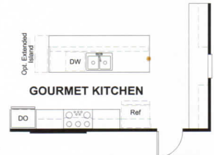
OPT. GOURMET KITCHEN