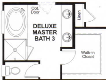
OPT. DELUXE MASTER BATH #3