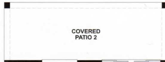
OPT. CENTER MEET DOOR AT NOOK