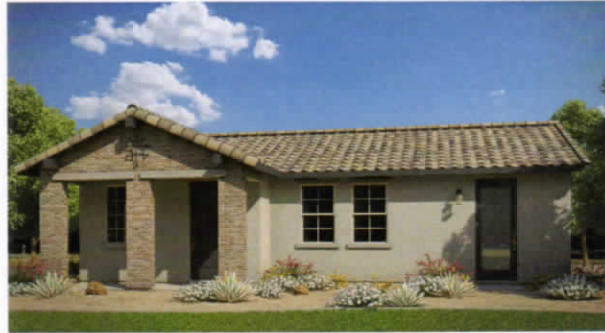
ELEVATION B – RANCH HACIENDA