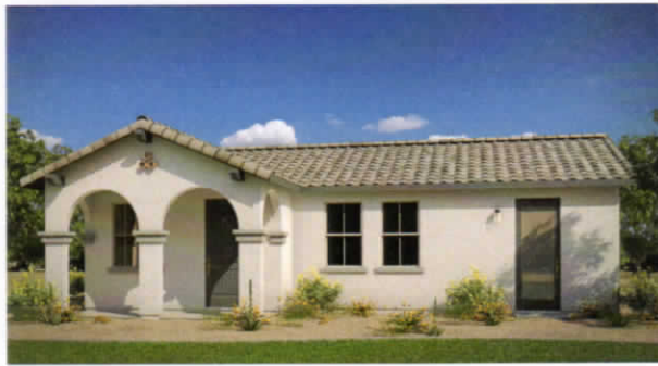
ELEVATION A – SPANISH