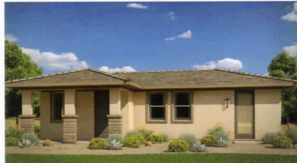
ELEVATION C – DESERT PRAIRIE