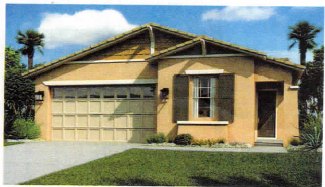
Elevation C | Craftsman