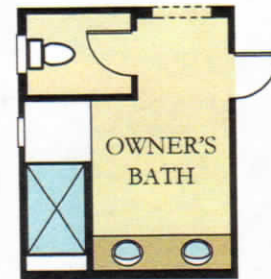
OPT. LUXURY BATH