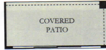
OPT. 16' MULTI-SLIDING DOOR