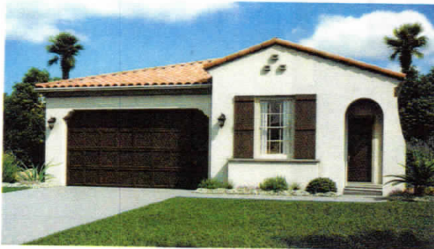
Elevation A | Spanish Colonial