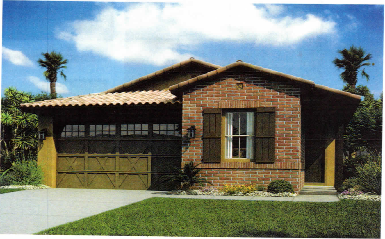
Elevation H | Ranch Hacienda

Palo Verde | Plan 3519 | Approx. 1,923 sq. ft. 4 Bedrooms | 2 Baths | 2-Bay Garage