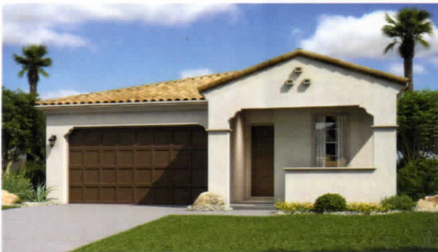
Elevation A | Spanish Colonial