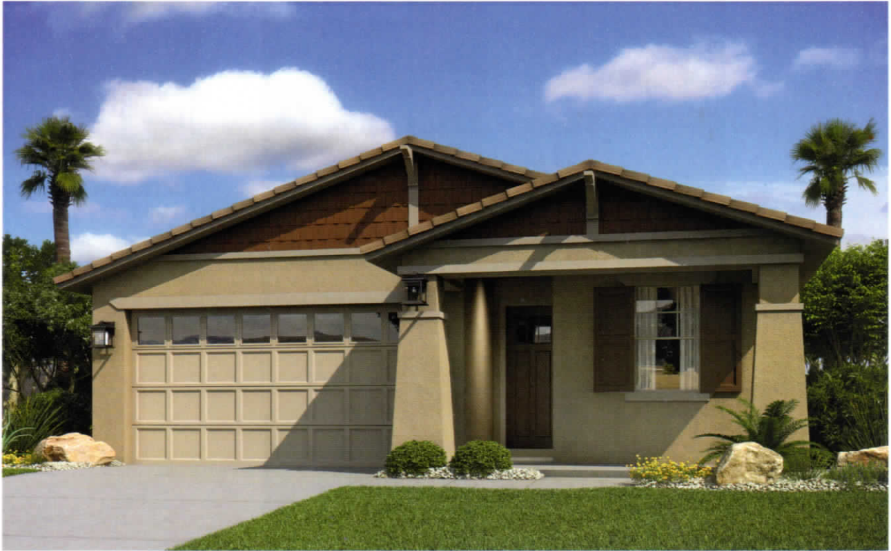
Elevation C | Craftsman

Ocotillo | Plan 3520 | Approx. 1,968 sq. ft. 4 Bedrooms | Study | 3 Baths | 2-Bay Garage