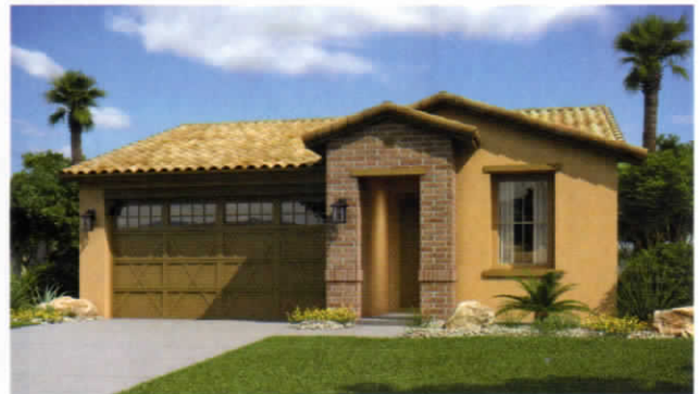
Elevation H | Ranch Hacienda