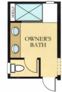
OPTIONAL LUXURY BATH