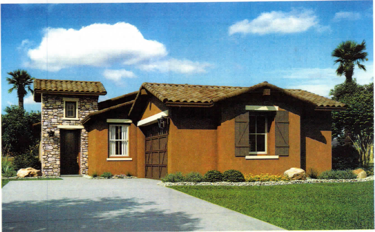
Elevation E | Tuscan

Mesquite | Plan 3516 | Approx. 1,742 sq. ft. 3 Bedrooms | Study | 2 Baths | 2-Bay Garage