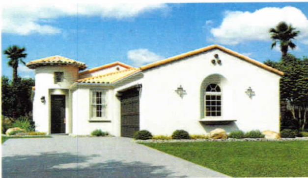
Elevation A | Spanish Colonial