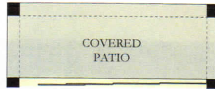
OPT. 20' MULTI-SLIDE DOOR