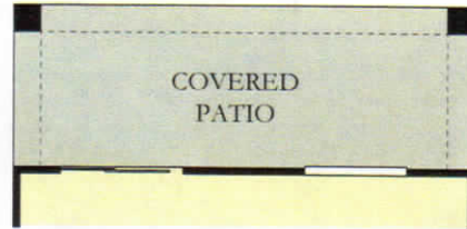
OPT. EXTENDED COVERED PATIO