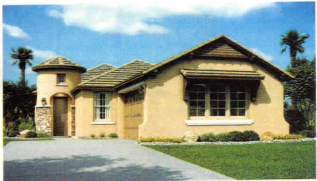
Elevation F | French Country