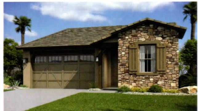
Elevation I | Western Territorial