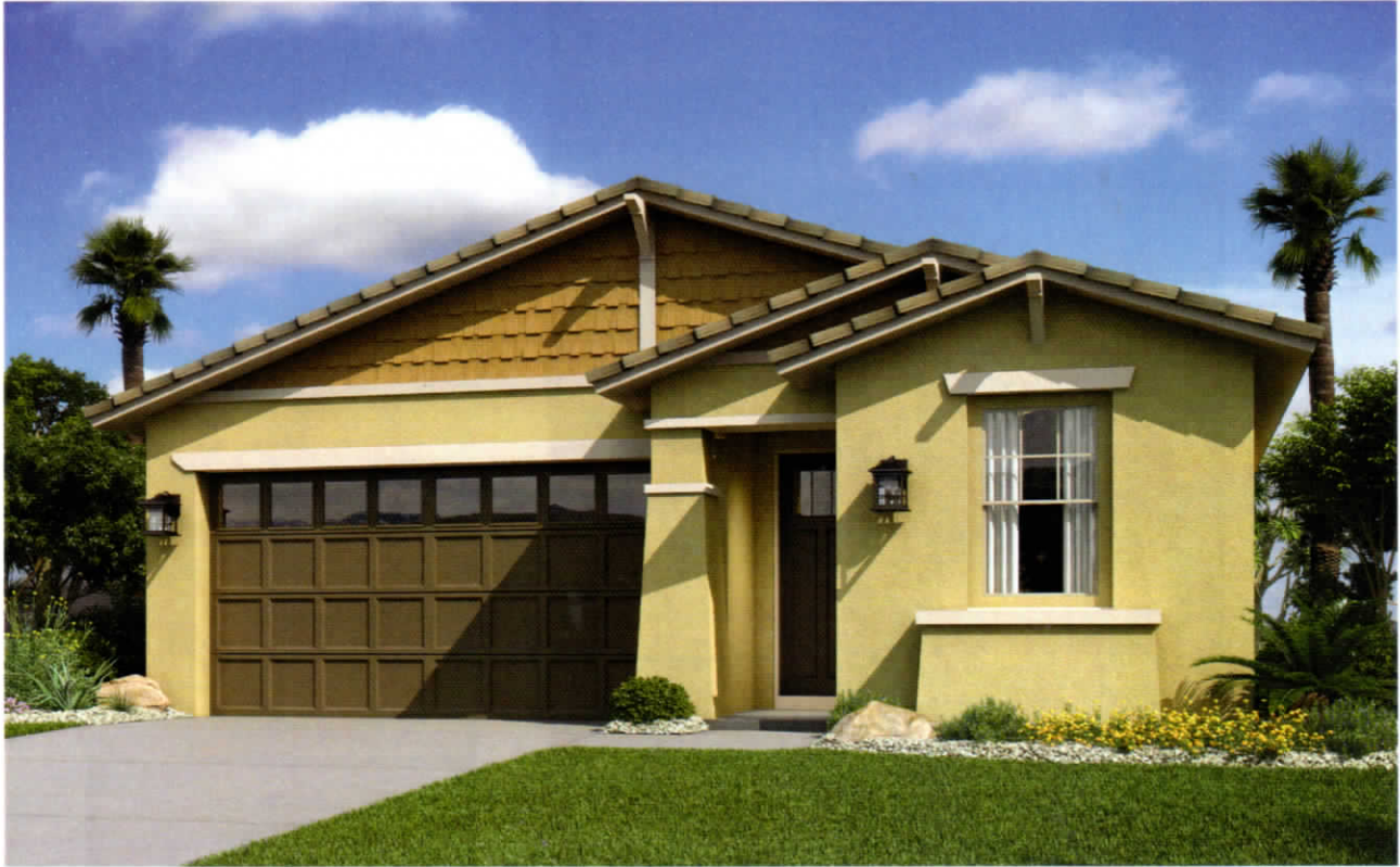
Elevation C | Craftsman

Ironwood | Plan 3518 | Approx. 1,771-1,943 sq. ft. 3-4 Bedrooms | 2.5-3 Baths | 2.5-Bay Garage