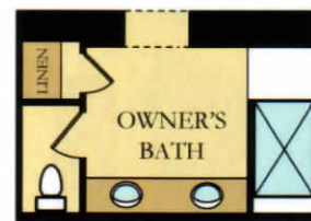
OPT. LUXURY BATH