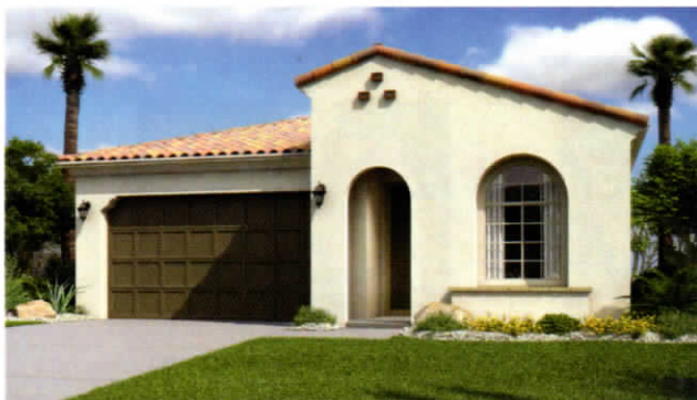
Elevation A | Spanish Colonial