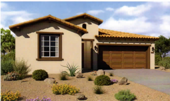
Spanish Hacienda - Elevation K