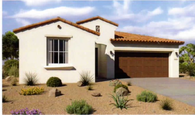
Spanish Colonial - Elevation J