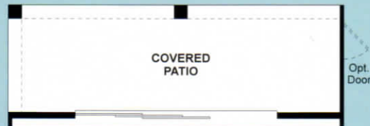
OPTIONAL 15' MULTI-SLIDING GLASS DOOR