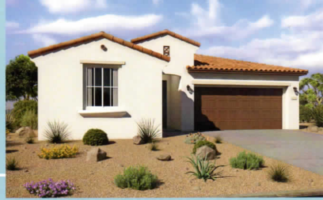
Spanish Colonial - Elevation J

1,605 Square Feet 3 Bedrooms • 2 Baths 2 Car Garage