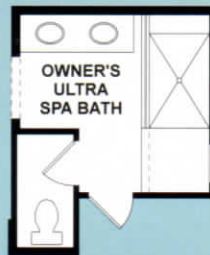
OPTIONAL OWNER'S ULTRA SPA BATH