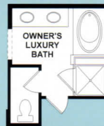
OPTIONAL OWNER'S LUXURY BATH