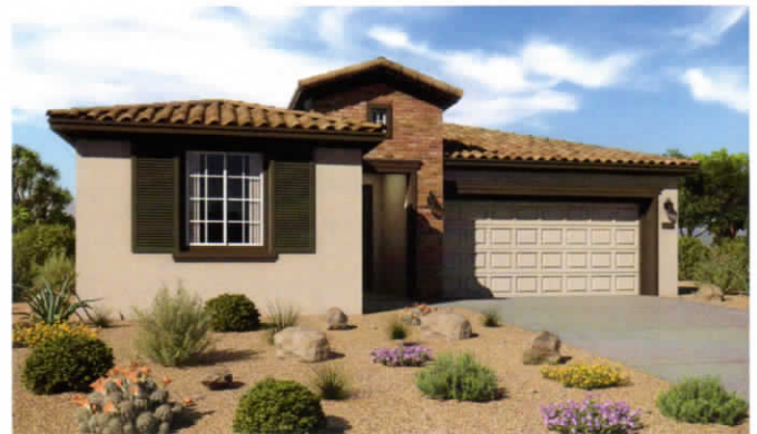
Mediterranean - Elevation L