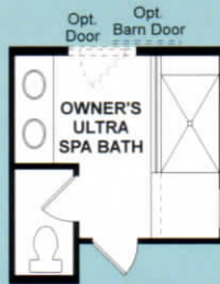
OPTIONAL OWNER'S ULTRA SPA BATH