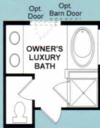
OPTIONAL OWNER'S LUXURY BATH