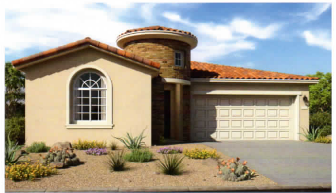
Mediterranean - Elevation L