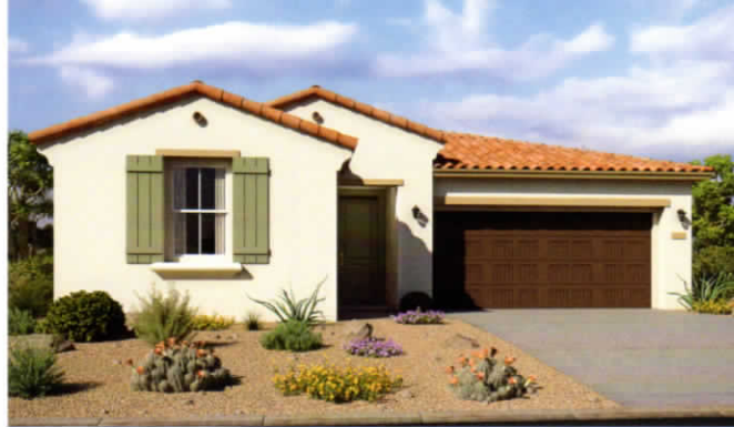
Spanish Colonial - Elevation J