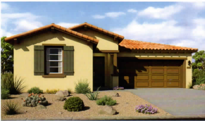
Spanish Hacienda - Elevation K