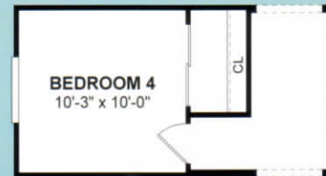
OPTIONAL BEDROOM 4 ILO DEN