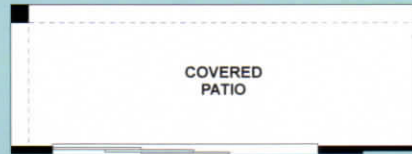
OPTIONAL 15' MULTI-SLIDING GLASS DOOR