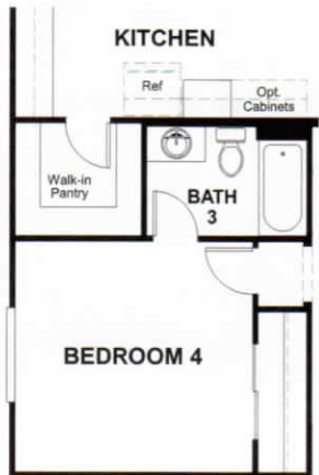
OPT. BEDROOM 4 W/ BATH 3