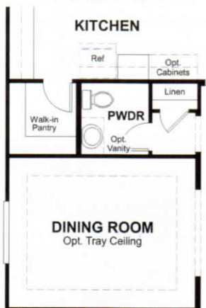
OPT. DINING ROOM