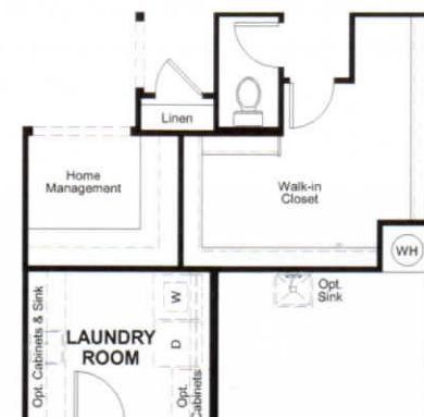
OPT. HOME MANAGEMENT

What's a HERS® Index? HERS stands for Home Energy Rating System, a system created by RESNET® to measure home energy efficiency.*