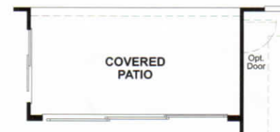
OPT. MULTI-SLIDE AT GREAT ROOM