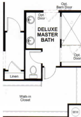
OPT. DELUXE MASTER BATH 2