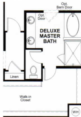
OPT. DELUXE MASTER BATH 1