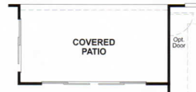
OPT. CENTER-MEET AT GREAT ROOM