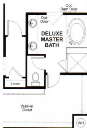
OPT. DELUXE MASTER BATH 3