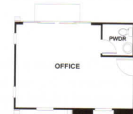
OPT. 12' CENTER-MEET DOOR AT OFFICE ILO FLEX ROOM