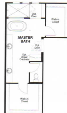
OPT. MASTER BATH WALK-IN SHOWER W/ FREE-STANDING TUB