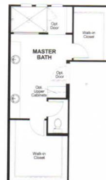
OPT. MASTER BATH WALK-IN SHOWER

What's a HERS® Index? HERS stands for Home Energy Rating System, a system created by RESNET® to measure home energy efficiency. ^