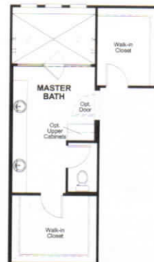
OPT. MASTER BATH WALK-IN SHOWER 2