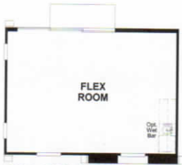
OPT. MULTI-SLIDE DOOR AT FLEX ROOM