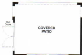
OPT. 12' CENTER-MEET DOOR AT GREAT ROOM