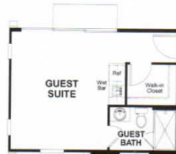
OPT. MULTI-SLIDE DOOR AT GUEST SUITE ILO FLEX ROOM