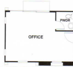
OPT. MULTI-SLIDE DOOR AT OFFICE ILO FLEX ROOM