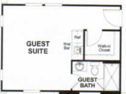
OPT. GUEST SUITE ILO FLEX ROOM