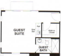
OPT. 12' CENTER-MEET DOOR AT GUEST SUITE ILO FLEX ROOM