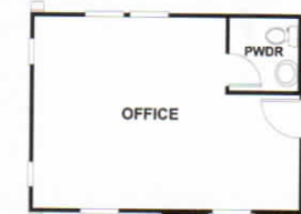
OPT. OFFICE ILO FLEX ROOM