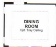
OPT. 12' CENTER-MEET DOOR AT DINING ROOM