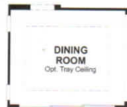
OPT. MULTI-SLIDE DOOR AT DINING ROOM