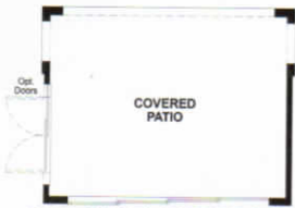
OPT. MULTI-SLIDE DOOR AT GREAT ROOM