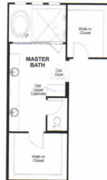
OPT. MASTER BATH SPA BATH