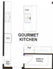
OPT. GOURMET KITCHEN