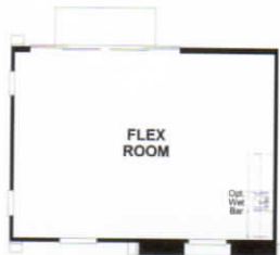
OPT. 12' CENTER-MEET DOOR AT FLEX ROOM