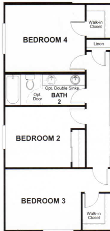
OPT. BEDROOM 4