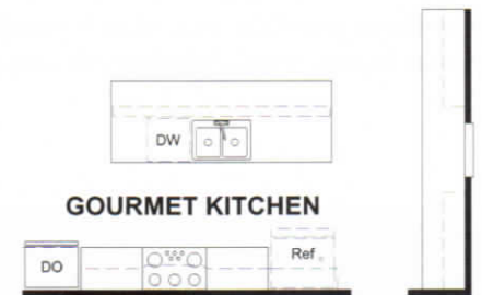
OPT. GOURMET KITCHEN

What's a HERS® Index? HERS stands for Home Energy Rating System, a system created by RESNET® to measure home energy efficiency. 1 A Projected HERS index or rating is a computer simulation performed prior to construction by a third-party HERS rater using RESNET-accredited rating software, rated feature and specification data derived from home plans, features and specifications, and other data selected or assumed by the rater. The projected HERS index is approximate and is subject to change without notice. Actual results will vary.