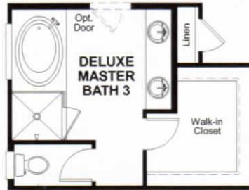
OPT. DELUXE MASTER BATH #3