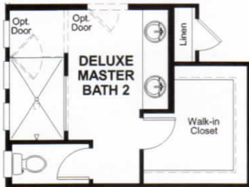
OPT. DELUXE MASTER BATH #2