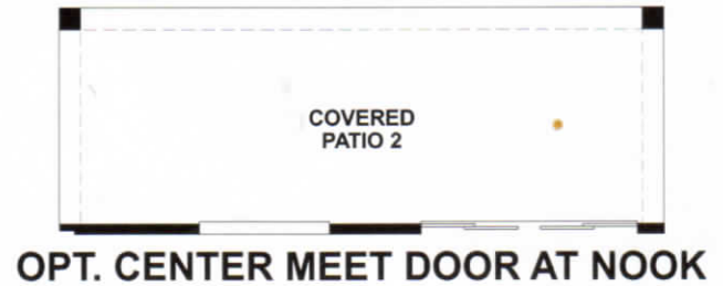
OPT. CENTER MEET DOOR AT NOOK