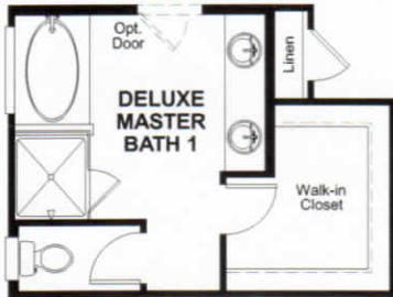
OPT. DELUXE MASTER BATH #1