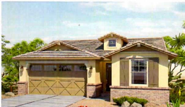
Western Farmhouse C