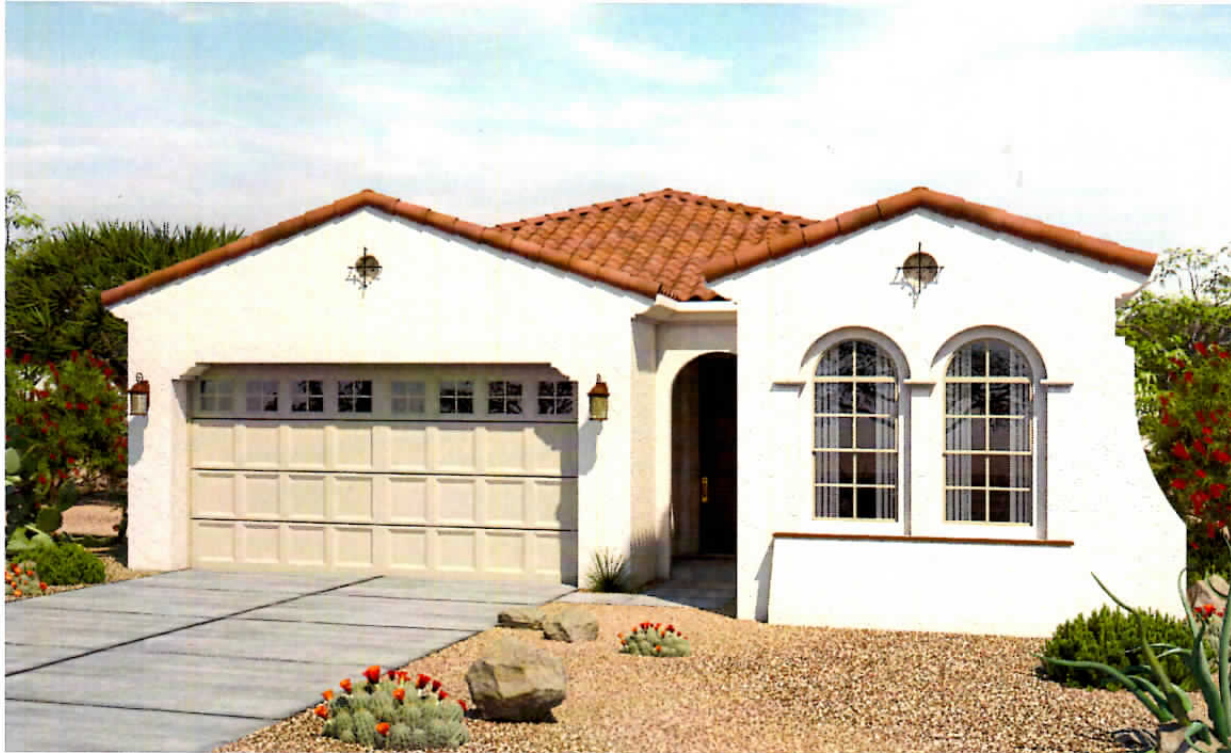
Spanish Colonial A

Golden Bell - 3573 | 2-3 Bedroom | 2 Bath | 2 Car Garage | 1,690 sq. ft.