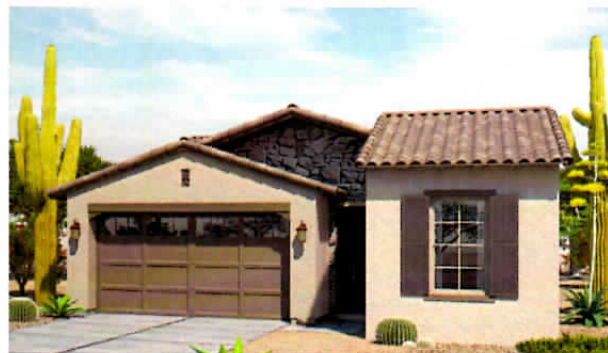
Rural Mediterranean E