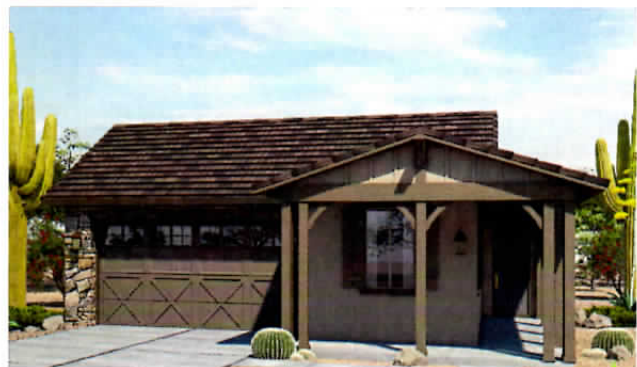
Western Farmhouse D