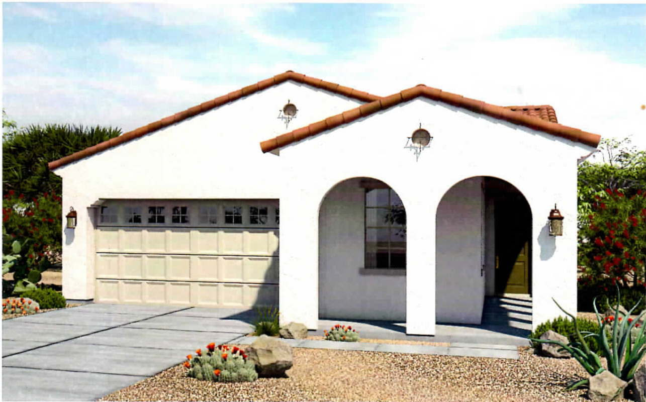
Spanish Colonial A

Magnolia - Plan 3570 | 2 Bedroom | 2 Bath | 2 Car Garage | 1,542 sq. ft.