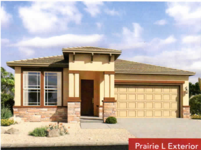
Prairie L Exterior