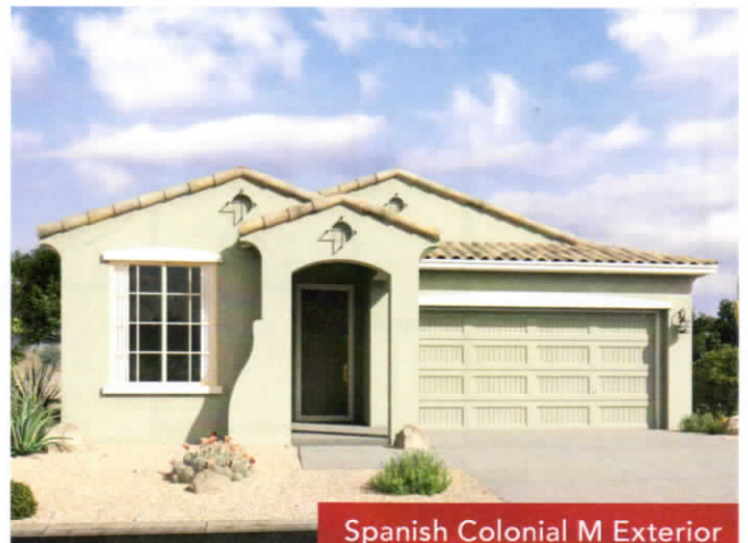
Spanish Colonial M Exterior