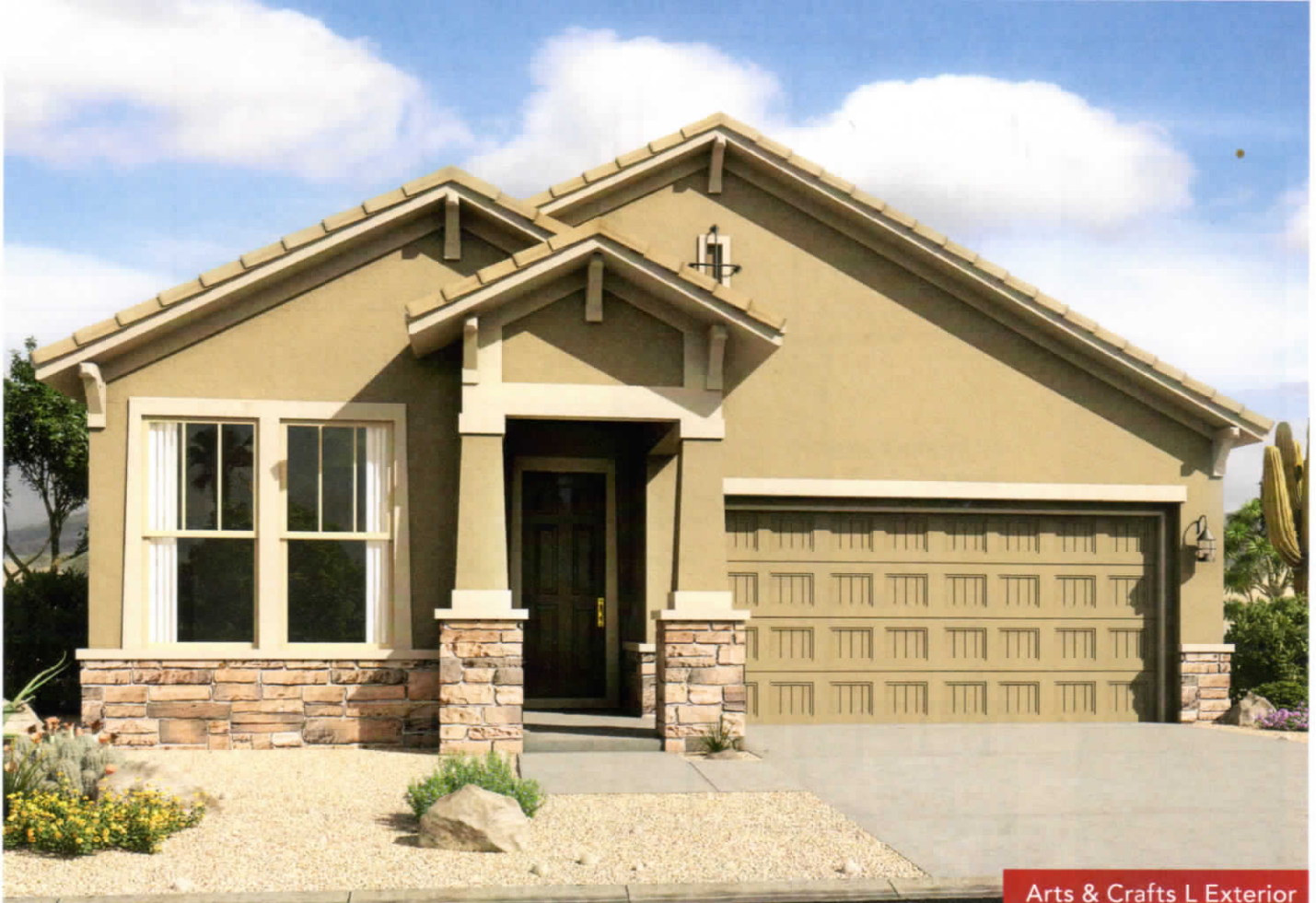
Arts & Crafts L Exterior

2-3 beds / 2 baths 1,610 sq. ft. 2-car garage