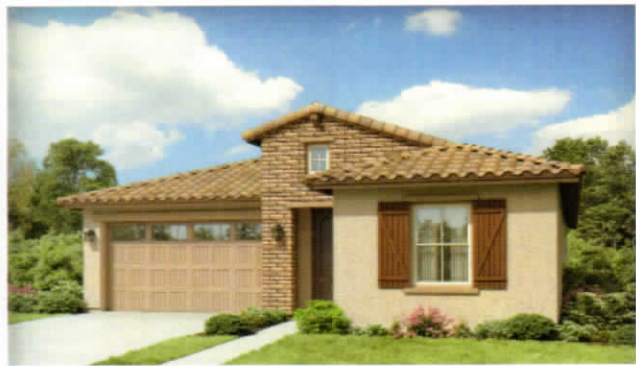
Elevation H | Ranch Hacienda