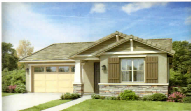
Elevation C | Craftsman