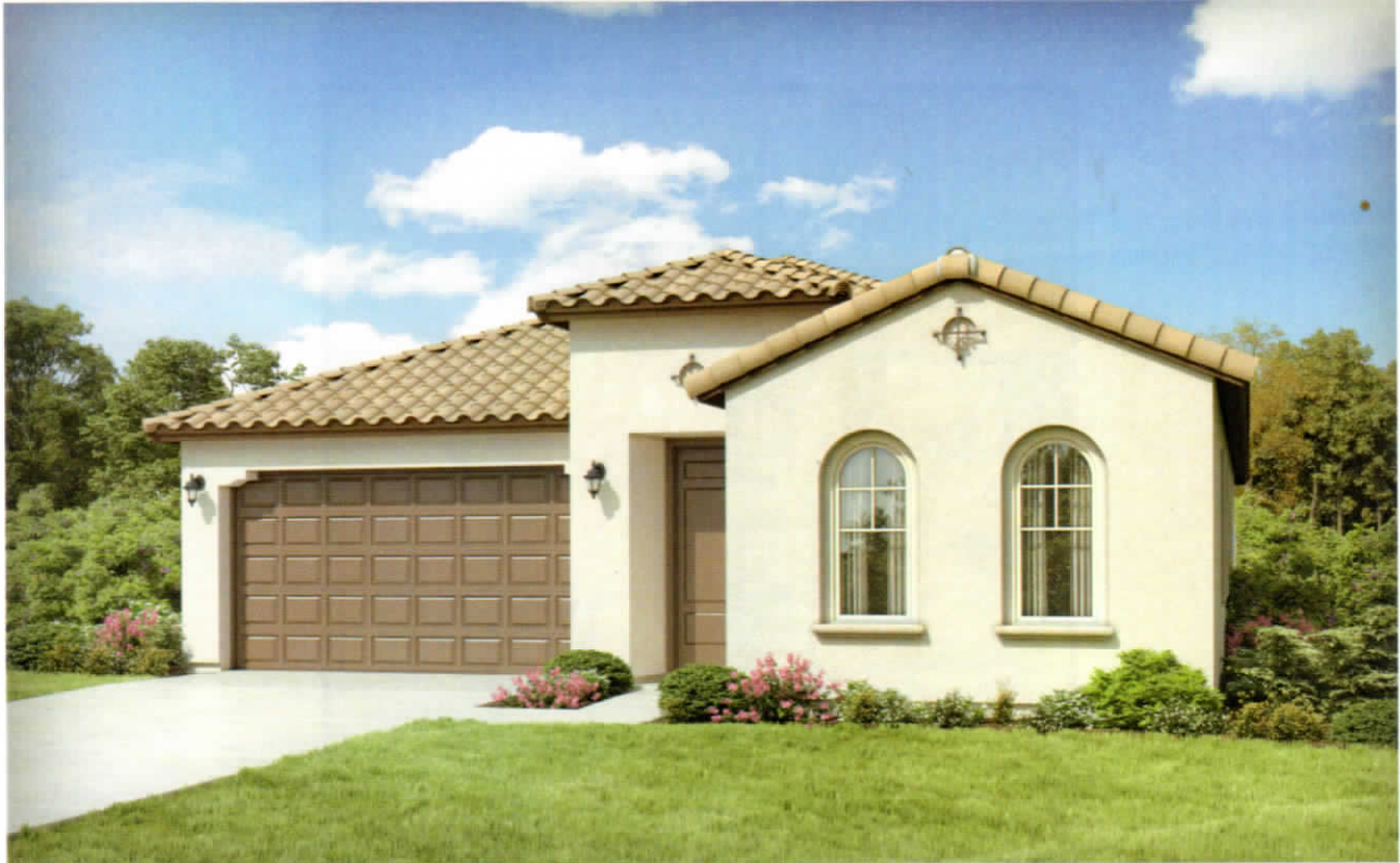
Elevation A | Spanish Colonial

Sage | Plan 4022 | Approx. 2,273 sq. ft. 4 Bedroom | 3 Bath | 2-Bay Garage