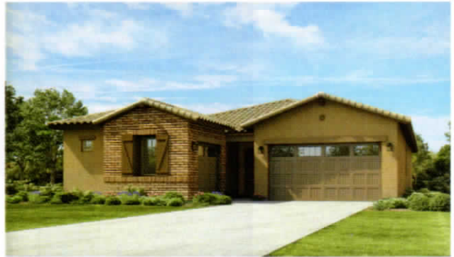
Elevation H | Ranch Hacienda