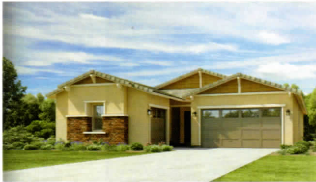
Elevation C | Craftsman