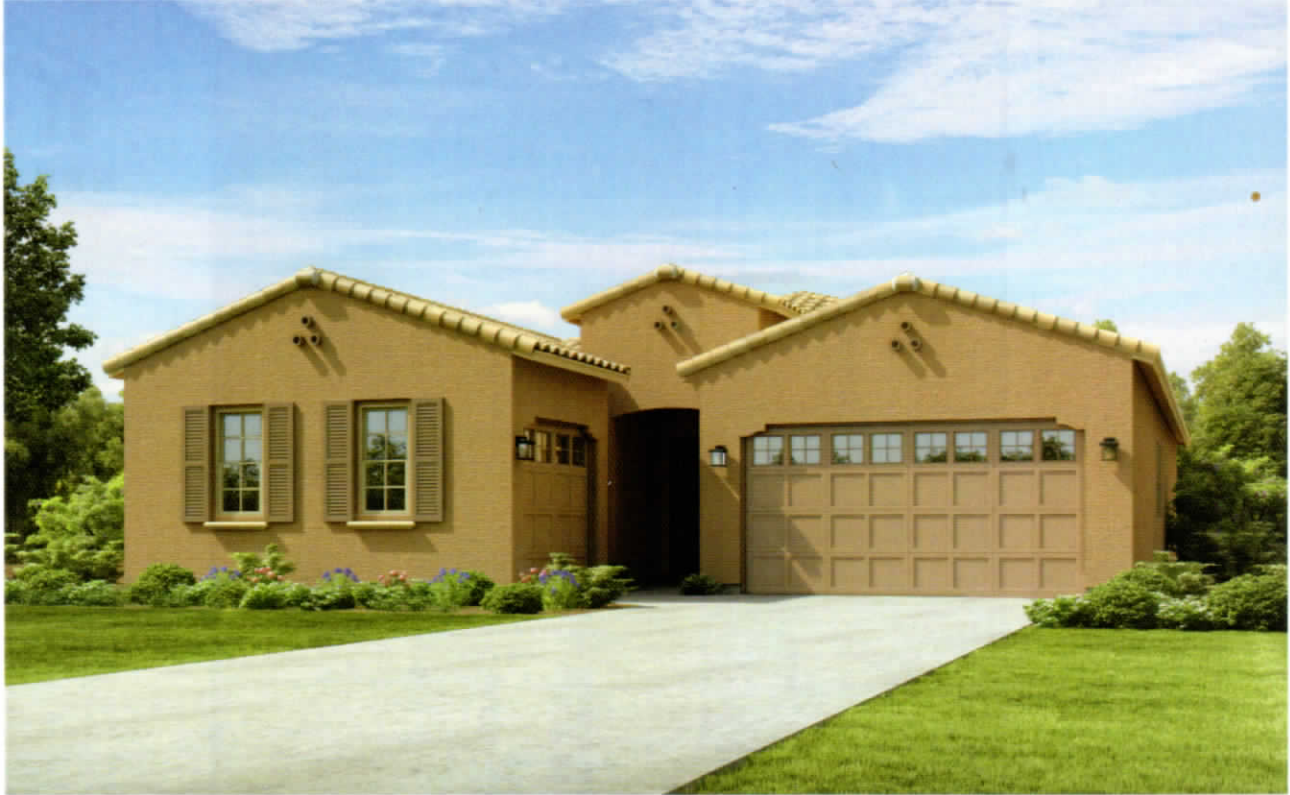
Elevation A | Spanish Colonial

Trillium | Plan 4585 | Approx. 2,649 sq. ft. 4 Bedrooms | 3 Baths | 3-Bay Garage Main Home 1,967 sq. ft. | Private Living Suite 682 sq. ft.