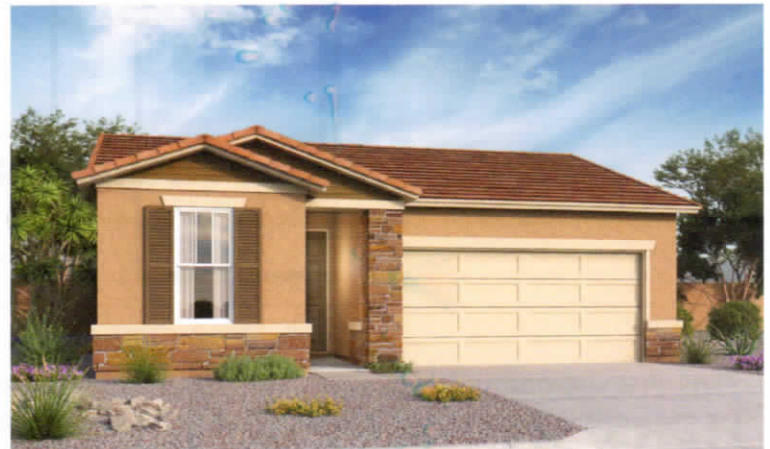
ELEVATION B - SHOWN W/OPT. STONE