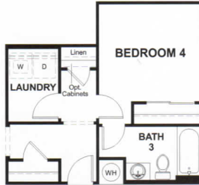
OPT. BATH 3 AT BED 4