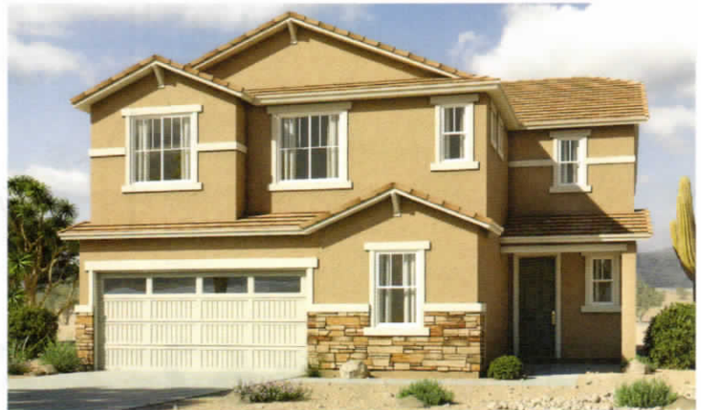
ELEVATION B - SHOWN W/OPT. STONE