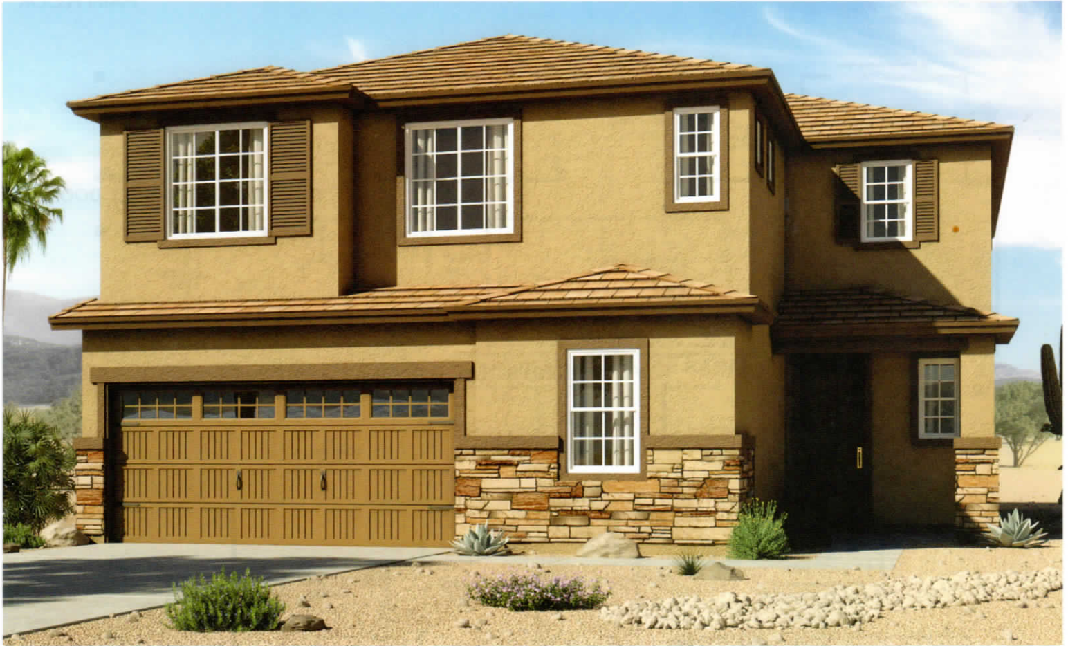
ELEVATION C - SHOWN W/OPT. STONE

Approx. 2,910 sq. ft. | 2 stories | 4-5 bedrooms | 2- to 3-car garage | Plan #P725