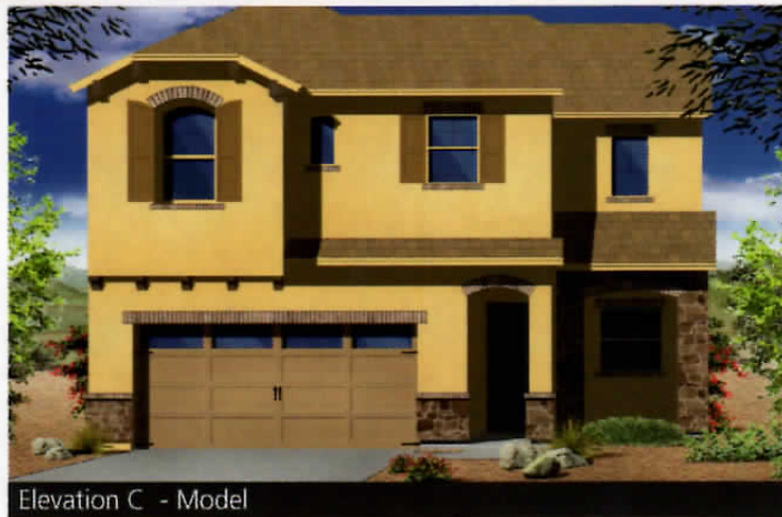
Elevation C - Model

Open the front door of the Flagstaff and discover a spacious foyer leading to a staircase on one side and the family living areas straight ahead. A gourmet kitchen adjoins the dining area and family room, which overlooks a large covered patio and the backyard. The bedroom and full bathroom on this floor would be perfect for teen or in-law quarters. Upstairs is a spacious master suite with a huge walk-in closet and retreat. Two more bedrooms share a large bathroom with dual sinks. The roomy loft can optionally become the fifth bedroom with an adjoining fourth bathroom.