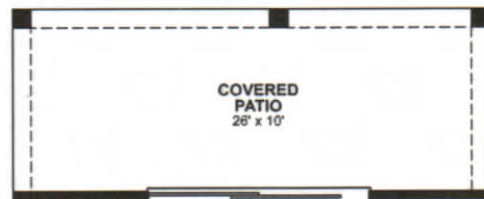
Opt 12' Sliding Glass Door with Extended Covered Patio