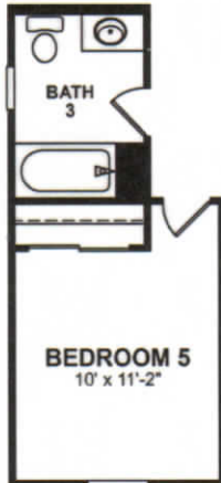
Opt Bedroom 5/Bath 3 ILO Study/Powder