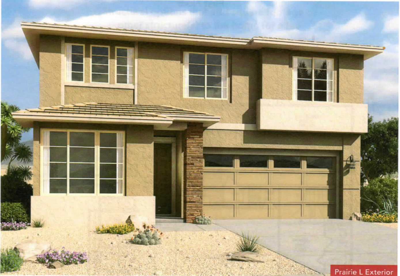
Prairie L Exterior