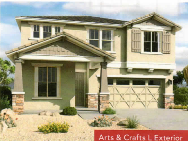
Arts & Crafts L Exterior