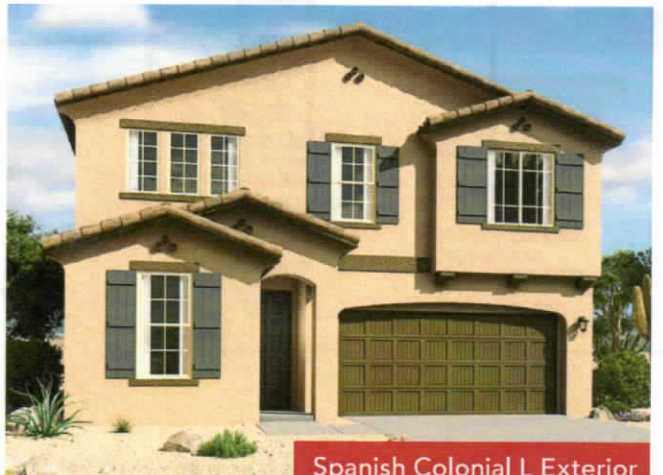
Spanish Colonial L Exterior