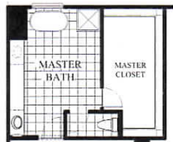
MASTER BATH FREE STANDING TUB OPTION