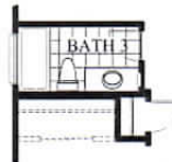
FULL BATH 3 AT POWDER OPTION