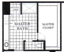
MASTER BATH SHOWER ONLY OPTION