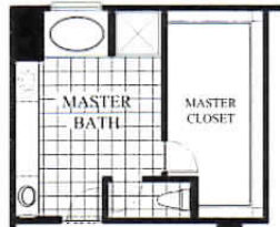
MASTER BATH SEPARATE SHOWER OPTION