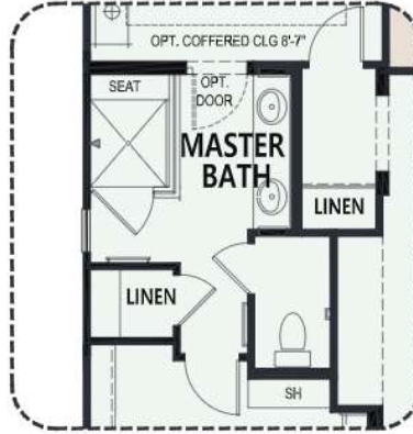
Opt. Curbless Shower