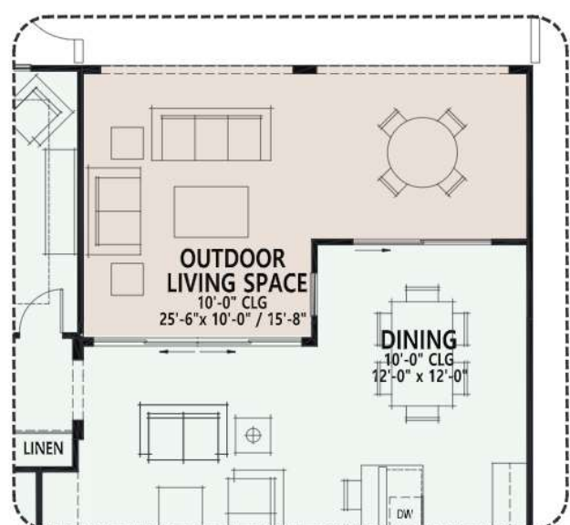
Opt. 12080 SGD

Due to the variety of options allowing you to personalize your home, there may be some options which cannot be combined due to structural limitations. Please check with your New Home or Design Consultant.