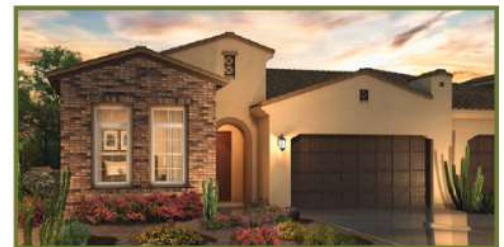
Exterior Design B