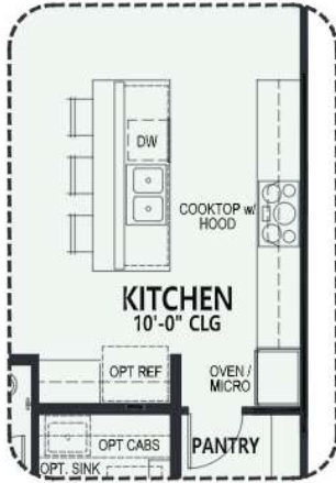
Alternate Built-in Kitchen

At PebbleCreek, you can personalize your home with a variety of options and features.