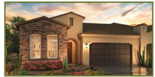
Exterior Design A