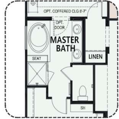
Opt. Drop-in Tub