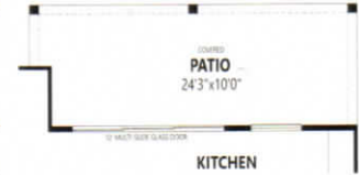
12' MULTI-SLIDE GLASS DOOR AT DINING