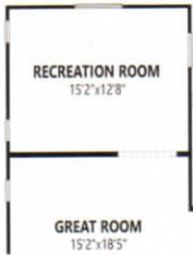
RECREATION ROOM (+205 SF.)