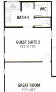
GUEST SUITE 2 WITH BATH 4 (+331 SF.)