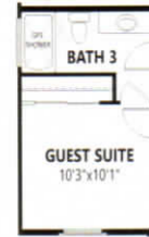
GUEST SUITE WITH BATH 3 IN LIEU OF FLEX ROOM AND POWDER ROOM