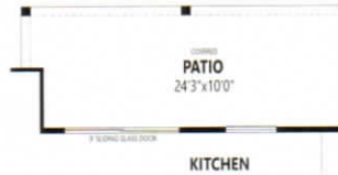
9' SLIDING GLASS DOOR AT DINING