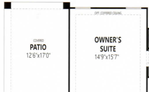
OWNER'S SUITE AND COVERED PATIO EXTENSION (+62 SF.)