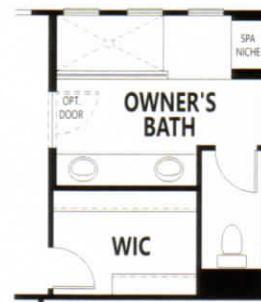
WALK-IN SHOWER WITH SPA NICHE