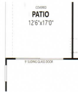
9' SLIDING GLASS DOOR AT GREAT ROOM