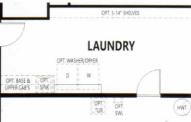
SUPER LAUNDRY IN LIEU OF GARAGE STORAGE (+141 SF.)