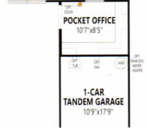
POCKET OFFICE (+101 SF.)