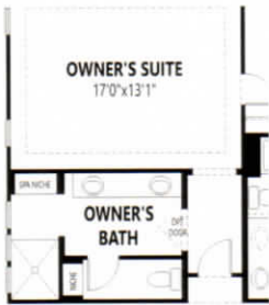
WALK-IN SHOWER WITH SPA NICHE