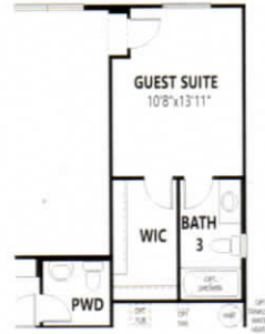
GUEST SUITE WITH BATH 3 IN LIEU OF TANDEM GARAGE