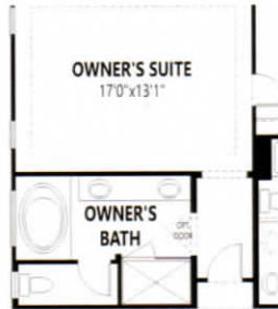
OWNER'S BATH OASIS