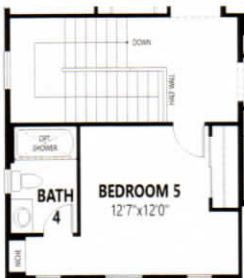
BEDROOM 5 WITH BATH 4 IN LIEU OF LOFT