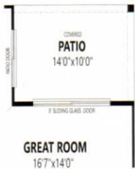
9' SLIDING GLASS DOOR