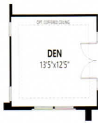
DEN IN LIEU OF FLEX ROOM