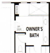
WALK-IN SHOWER WITH SPA NICHE