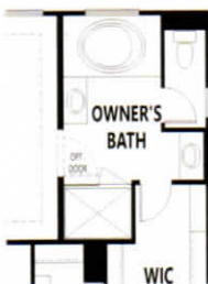
OWNER'S BATH OASIS