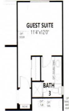
GUEST SUITE WITH BATH 3 IN LIEU OF TANDEM GARAGE (+271 SF.)