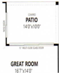
12' MULTI-SLIDE GLASS DOOR