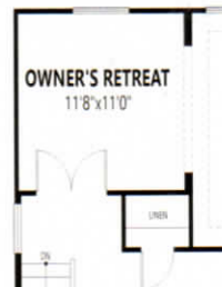
OWNER'S RETREAT IN LIEU OF LOFT