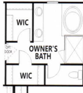
OWNER'S BATH OASIS