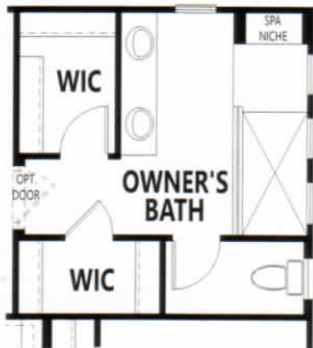
WALK-IN SHOWER WITH SPA NICHE