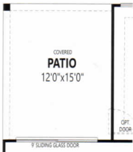
9' SLIDING GLASS DOOR AT GREAT ROOM