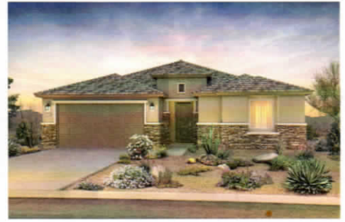
Elevation C with Stone