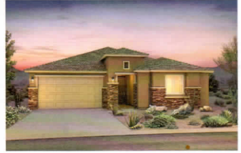
Elevation C with Stone