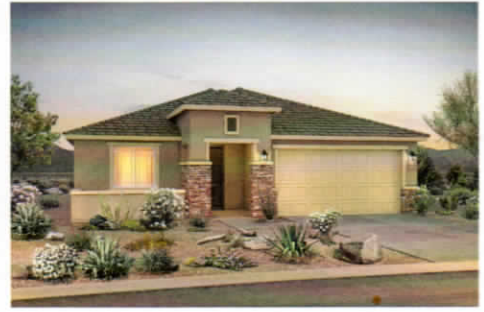
Elevation C with Stone