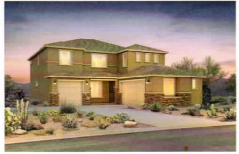
Elevation C with Stone