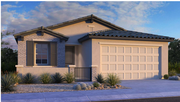
Elevation - D Tuscan