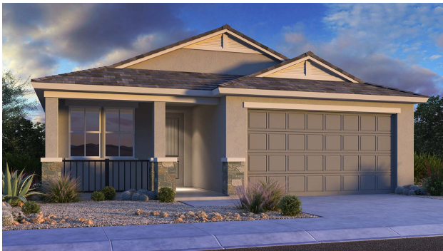
Elevation - B Ranch