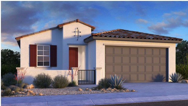
Elevation - A Spanish