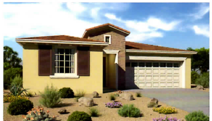
Mediterranean - Elevation C