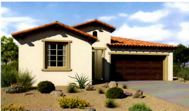
Spanish Hacienda - Elevation B