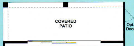
OPTIONAL MULTI-SLIDING GLASS DOOR