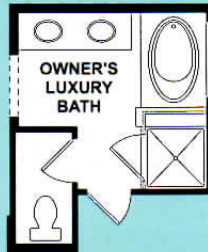
OPTIONAL OWNER'S LUXURY BATH