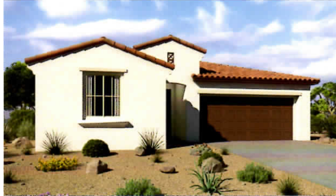
Spanish Colonial - Elevation A