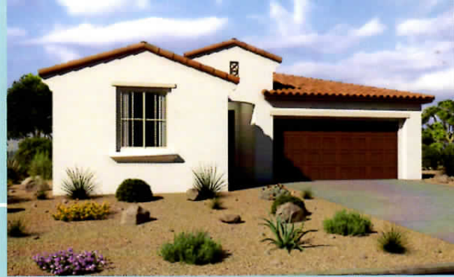
Spanish Colonial - Elevation A