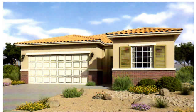
Italianate - Elevation F