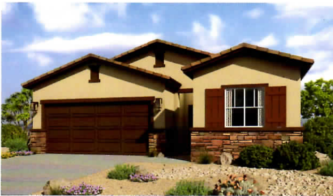
Craftsman - Elevation E