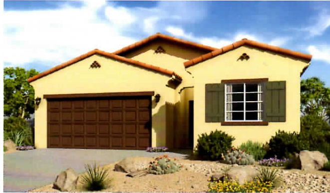
Spanish - Elevation D