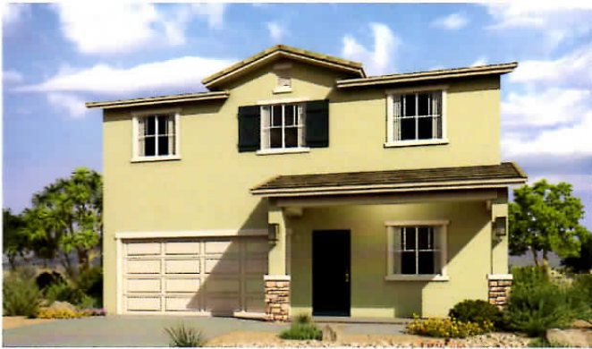
Craftsman - Elevation E