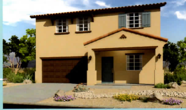
Spanish - Elevation D