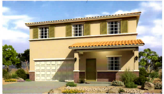
Italianate - Elevation F