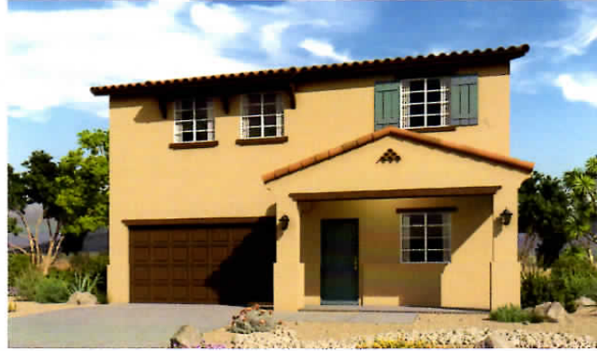
Spanish - Elevation D