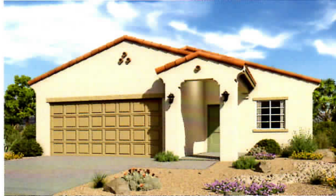
Spanish - Elevation D