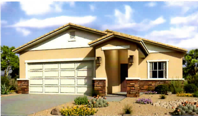
Craftsman - Elevation E