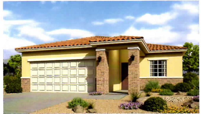
Italianate - Elevation FF