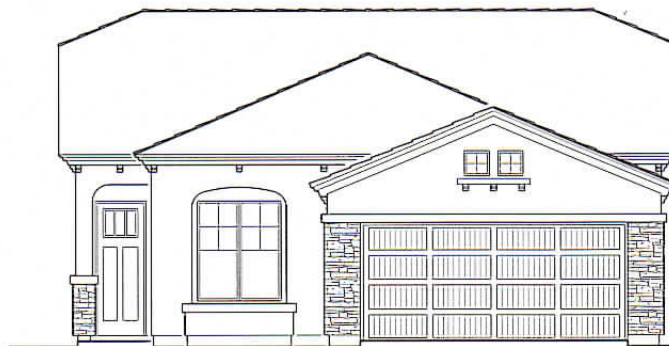
FRONT ELEVATION: F