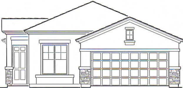
FRONT ELEVATION: C