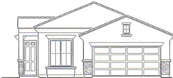
FRONT ELEVATION: D OPTIONAL STONE VENEER SHOWN