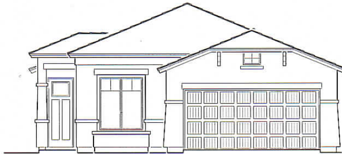
FRONT ELEVATION: E