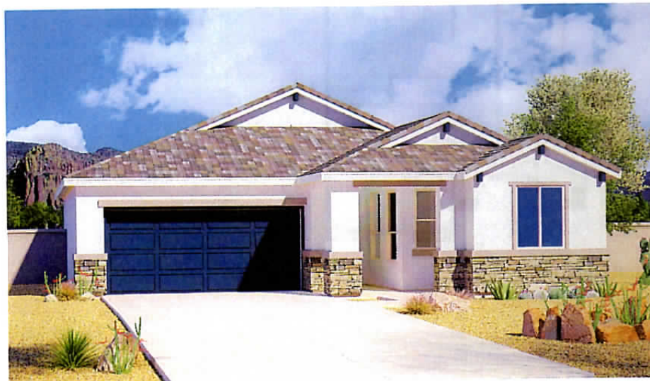
Elevation C Standard LedgeStone Available