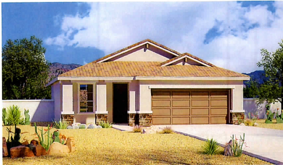
Elevation C Standard LedgeStone Available