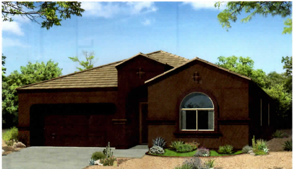
Elevation B Shown with Standard Color Blocking