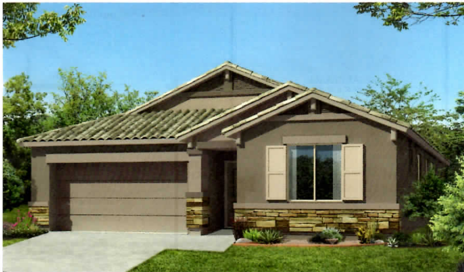
Elevation C Shown with Standard Color Blocking Standard LedgeStone