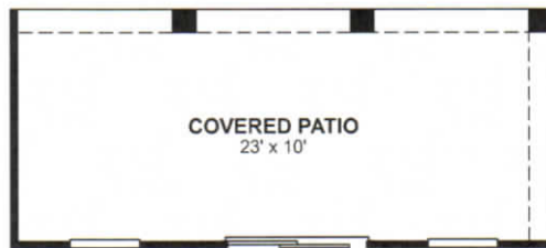
Opt Extended Covered Patio

Structural options that add square footage or other structure(s) to the home for a fee