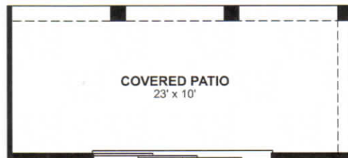
Opt 15' Sliding Glass Door w/ Extended Covered Patio