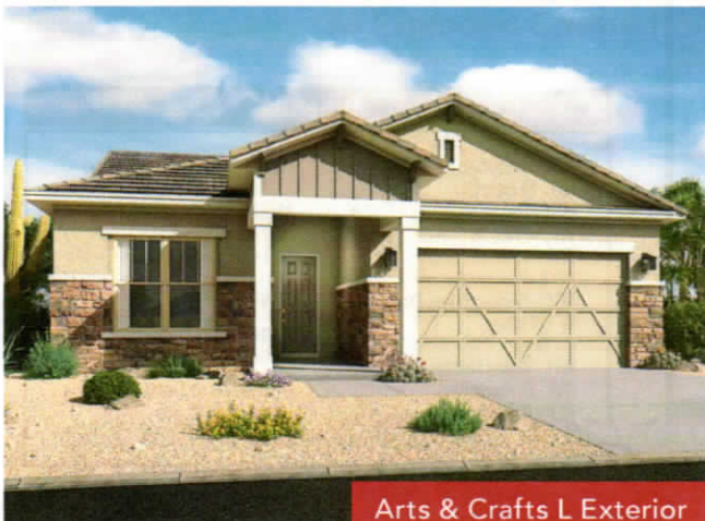
Arts & Crafts L Exterior