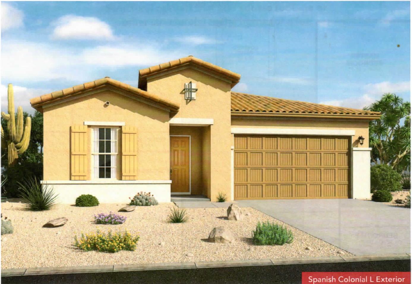
Spanish Colonial L Exterior