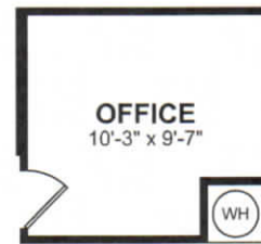
Opt Office ILO Storage