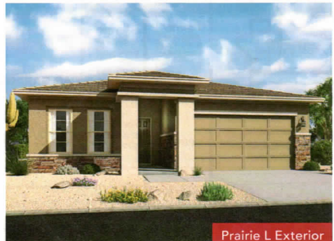
Prairie L Exterior